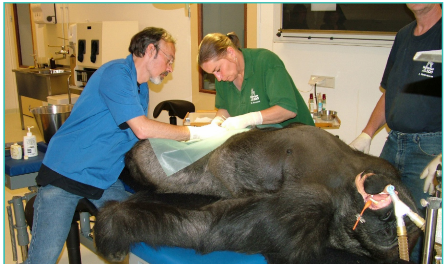
The proverbial 800# gorilla in the room at the Rotterdam Zoo in Rotterdam, Netherlands! Shank's tables have held everything from horses and rhinoceroses to gorillas and large marine life over their years in production.

The company continued to grow as the specialized needs of the veterinarian practitioner increased. Shank's expanded quickly into other areas of the large animal market products with customized surgery tables, necropsy tables, stocks and transfer carts, as well as marketing and manufacturing a line of heavy-duty recovery stall doors, induction/crowding gates and a wide range of pertinent industry products.