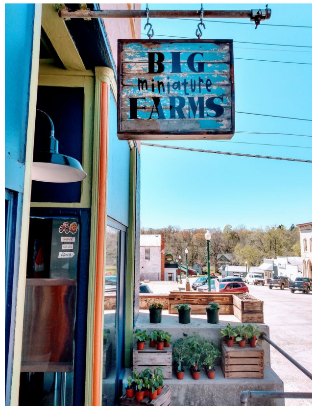
Big Miniature Farms is located at the corner of Market and Main Streets in Mount Carroll's Historic District. Building renovations took over six months to complete.