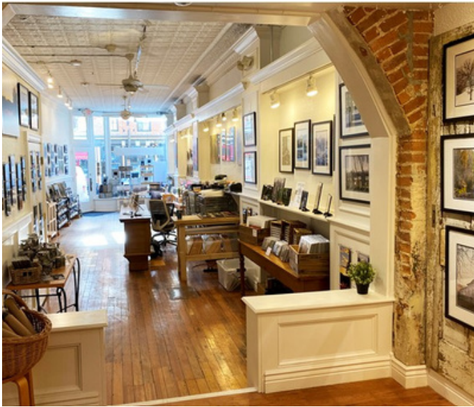
An interior view of River Bend Gallery at 112 N Main Street in downtown Galena. The gallery originally opened at 243 N Main.

River Bend Gallery connects with business-owning locals and gift-shopping tourists alike. It remains a small, family-run and staffed business, employing 2-3 additional part-time employees. Popular items include framed prints hand signed by Geoffrey with his signature 'G,' seasonal ornaments, inspire tiles, and slate and barnwood mounts.